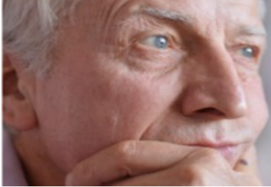
These Are The Only 6 Stocks You Need In Your Portfolio