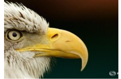
Less than 100 days to go - what U.S. firms need to know about MiFID II