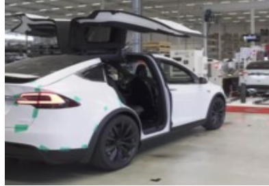
Norway's electric car owners face 'Tesla tax'